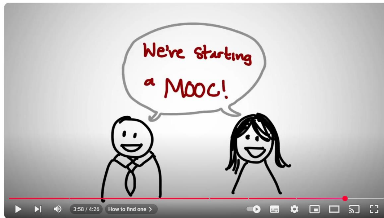
What is a MOOC?