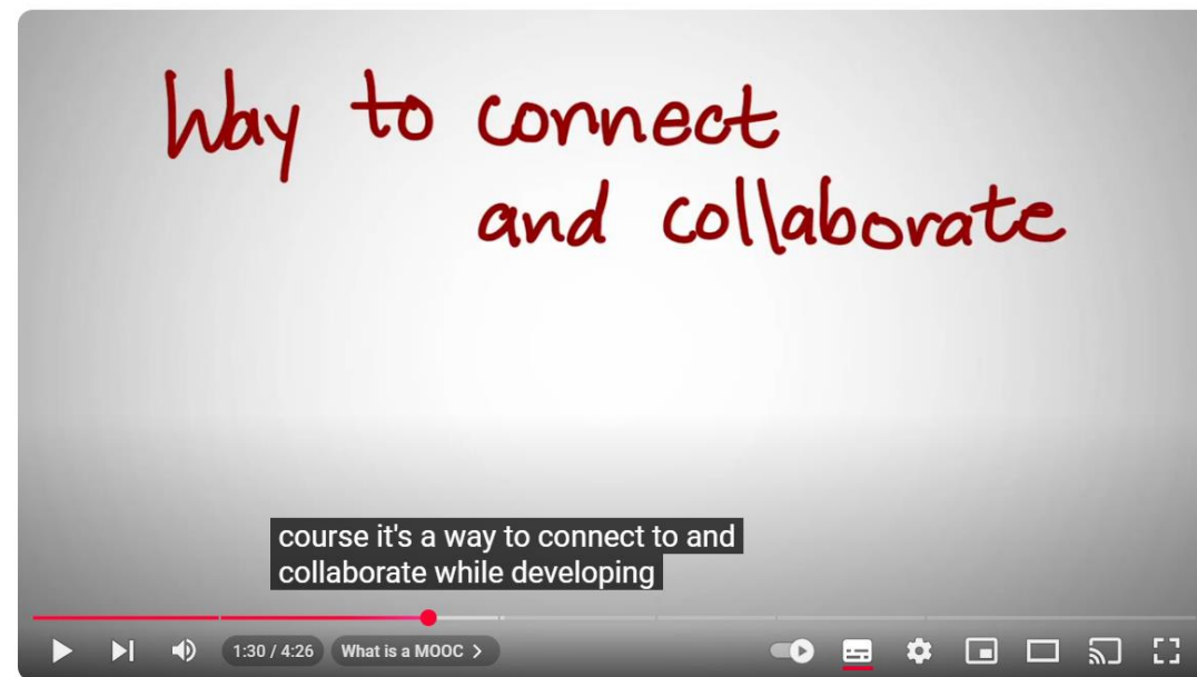
What is a MOOC?